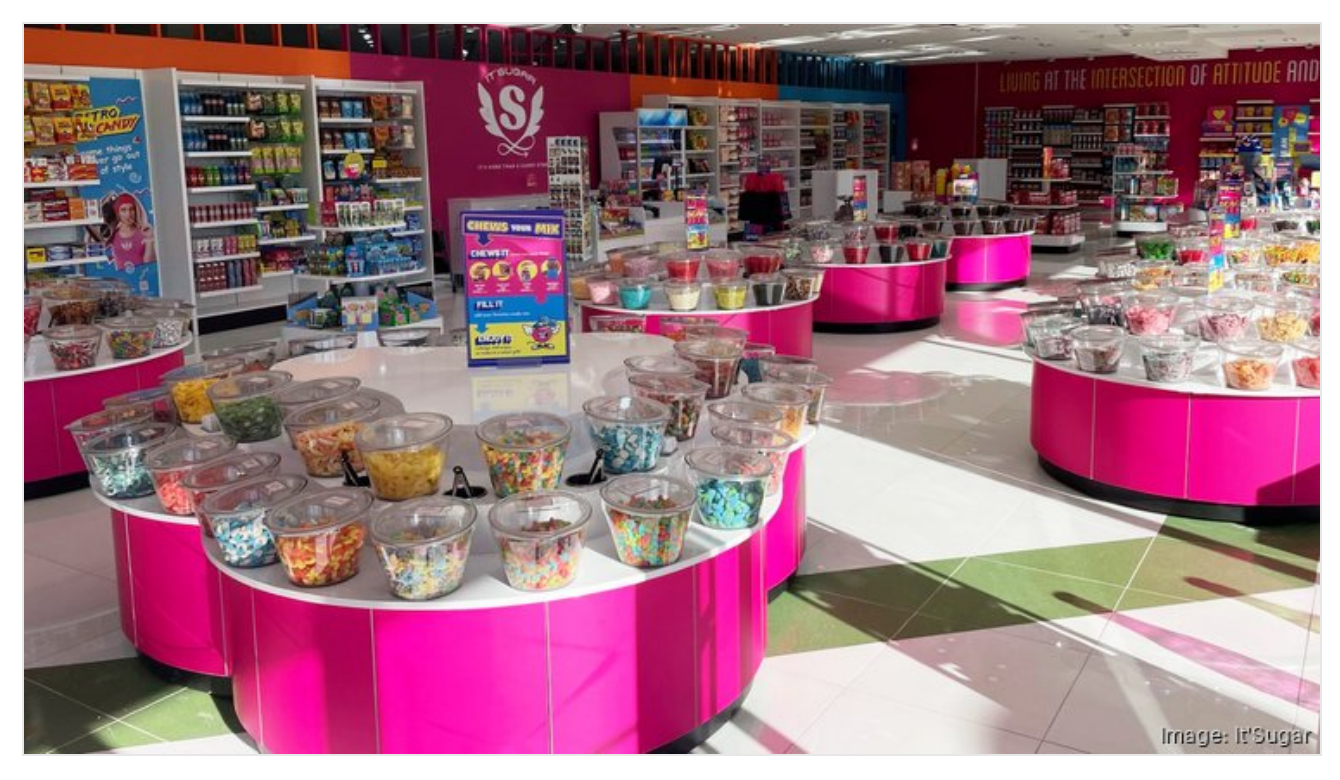
This new candy shop is national candy store chain It'Sugar's first location in St. Louis. It's located in The District development in Chesterfield. IT'SUGAR

Along with modern types of candy such as Oreos and Sour Patch Kids, the shop has sections highlighting international and retro types of candy, and types of candy that have trended on the social media app TikTok, according to the retailer.