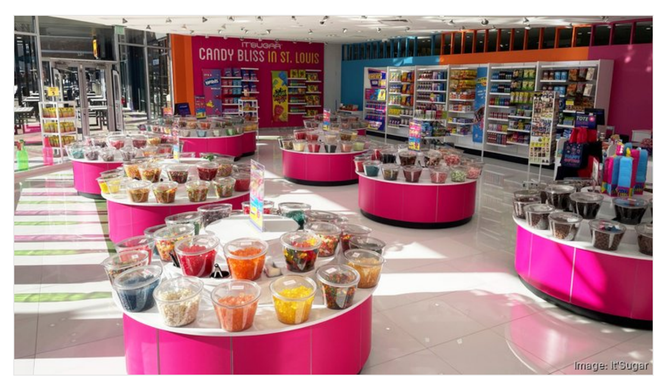
The new It'Sugar candy shop in The District has 260 bins.

It'Sugar is part of BBX Sweet Holdings, which is a subsidiary of BBX Capital, a Florida-based diversified holding company.